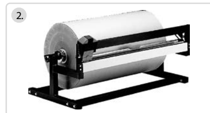
Table top cutter: